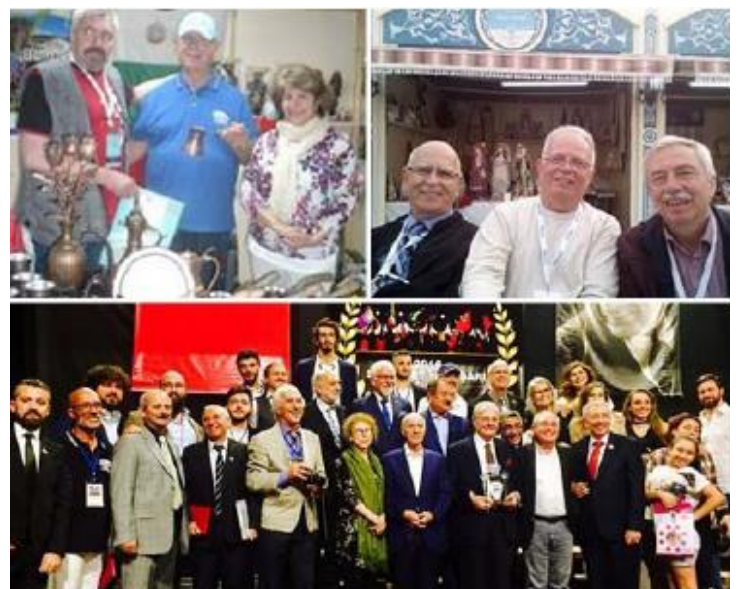
International Traditional Meeting of Artists in Pendik, Turkey