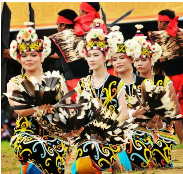
Erau International Folklore and Folk Art Festival in Tenggarong, Indonesia