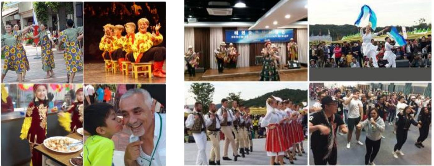
Yilan International Children's Folklore and Folkgames Festival in Chinese Taipei

The main activities and events in the Sector Included: